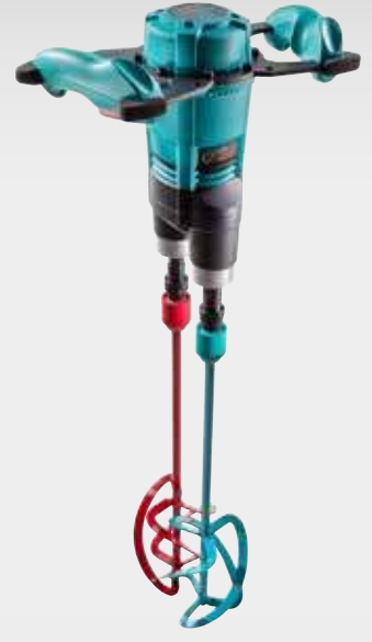
› Xo 55 R duo