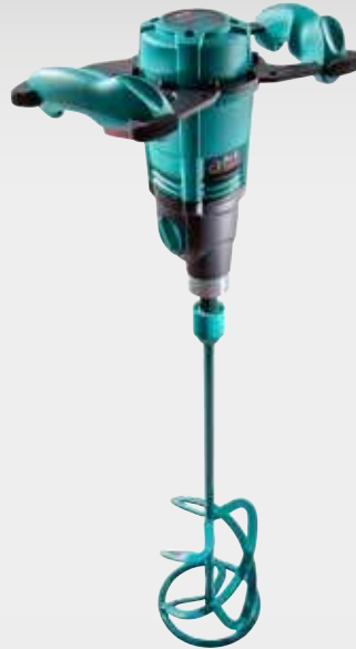
› Xo 6 R