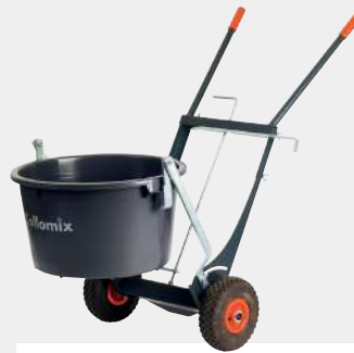
Additional accessory: Transport trolley