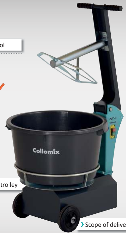
Scope of delivery